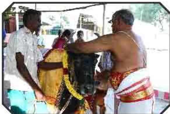
Go pooja at Shakti Peedam

remained the force of sacrifice on all these days. The blessings for the devout, without doubt in fulfillment of their wishes, will abound in large measure as they will be the recipients of the divine powers invoked at Madambakkam Siddhar Peedam for sure!