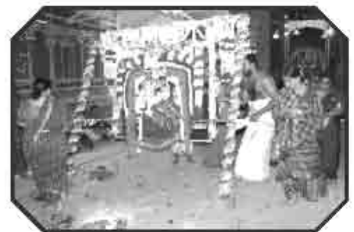
Devotee in decorated swing during Marriage celebrations at Aaradhana 2015