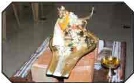
Sri Kamadhenu Abhishekam