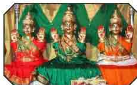
Mahalakshmi Mandapam with Durga and Saraswathi