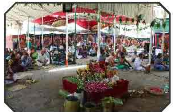
A view of the Mandapam with kalashapooja