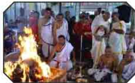
Just before Poomahuthi