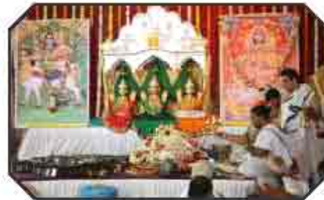
Prana Prathista of the Havan Dieties done by the Learned Purohit