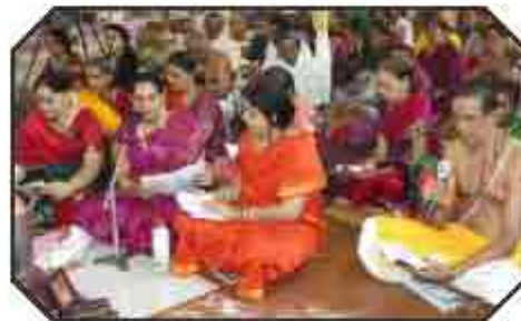
Sri Lakshmi Sahasranama Parayanam