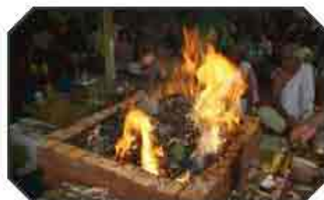
Poomahuti-Agni appears as moving cow