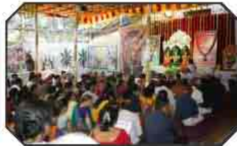
Another View of the rapt devotees immersed in the Homams.