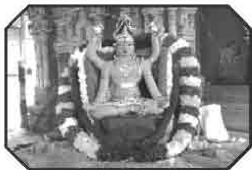
Decorated idol of Sri Mrutyunjayar

Madambakkam and allied areas to the accompaniment of Nadaawaram recital, Mantra japam and songs. The idea of the Lord reaching out to the disabled devotees and pious people at their doorsteps to give darshan and blessings has no parallel. The festivity came to a close with the return of the Mahan to the temple with the devotees following the trail with impressions lasting for a long time.