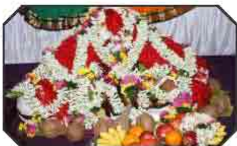
Homa Mandala Sthapanam