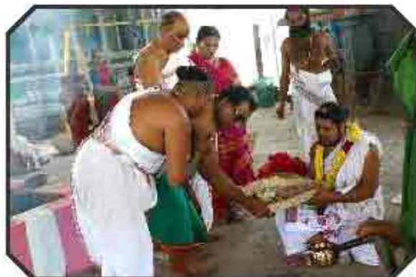
Honouring the Guru