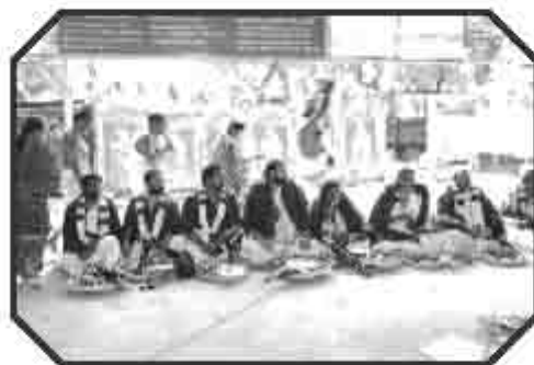
Guru Puja during Sathguru Aaradhana celebrations