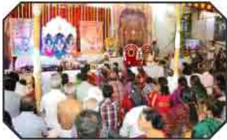
A section of Devotees in the Havan

In the adjacent hall, where as Thiruvalluvar said, 'Seviku unuvum bodhu aridhu vayittrukkum ombappadam,' Annadanam as part of the offering to the divine and mankind, was organized with a delightful and thoughtfully prepared menu satiated the palate too. The devotees, who recalled the commendable effort made by the members of the Trust, patrons, devotees and the well-wishers of Sri Seshadri Swamikal to make this Havan a grand success and inspiring returned not only with bag-filled prasadam but also with mind fired by inspiration and hearts filled with contentment of day gainfully spent in the thought of the Divine in Mumbai. The highlight was their offerings in many ways by way of donations in cash and kind and the ever flowing contribution for the temple construction work, the more importantly for the maintenance and upkeep of the Goshala at the Shakti peedam at Medambakkam.